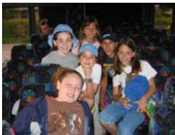
4th grade girls relaxing!

Camp - classroom we are finishing our ing is Timeline of life work. We are part of also beginning a unit on creat h e t i v e writing. Practi- April's field c a l trip will take L i f e us to Spanish c u r - River Beach.