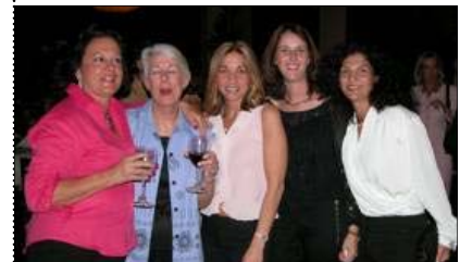
The staff socializes with families and friends!

Thank you all for your support and generosity. We look forward to see you all there next year