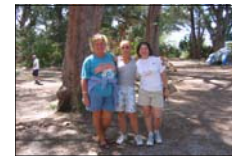
Our brave teachers!