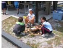
Do they have a dishwasher?

Camp - classroom we are finishing our ing is Timeline of life work. We are part of also beginning a unit on creat h e t i v e writing. Practi- April's field c a l trip will take L i f e us to Spanish c u r - River Beach.