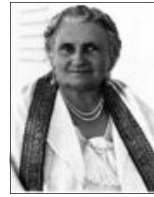
Dr. Maria Montessori