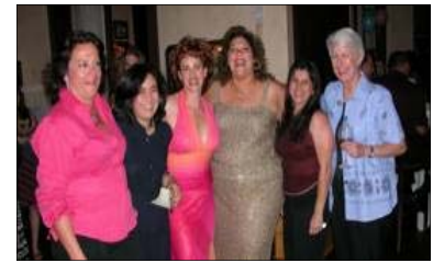
What a gorgeous crew!

KARATE: the last class on May 27th will be a demonstration of their technique. Bring your cameras, it is amazing!